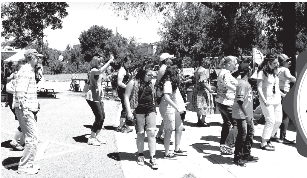
Dancing to The Drummer Man!